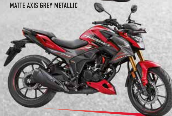
MATTE SANGRIA RED METALLIC

BOOK ONLINE NOW! www.honda2wheelersindia.com