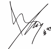
Marc Marquez MotoGP Champion