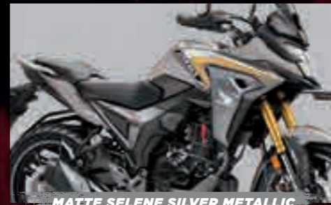
MATTE SELENE SILVER METALLIC