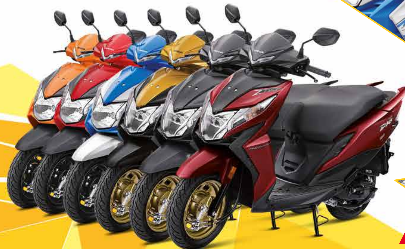
DAZZLE YELLOW METALLIC