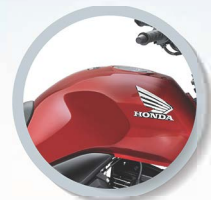
Imperial Red Metallic