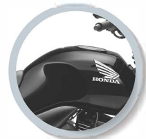
Pearl Igneous Black