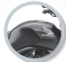
Mat Axis Gray Metallic